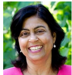
Ela Pandya Zonta Club of Porterville